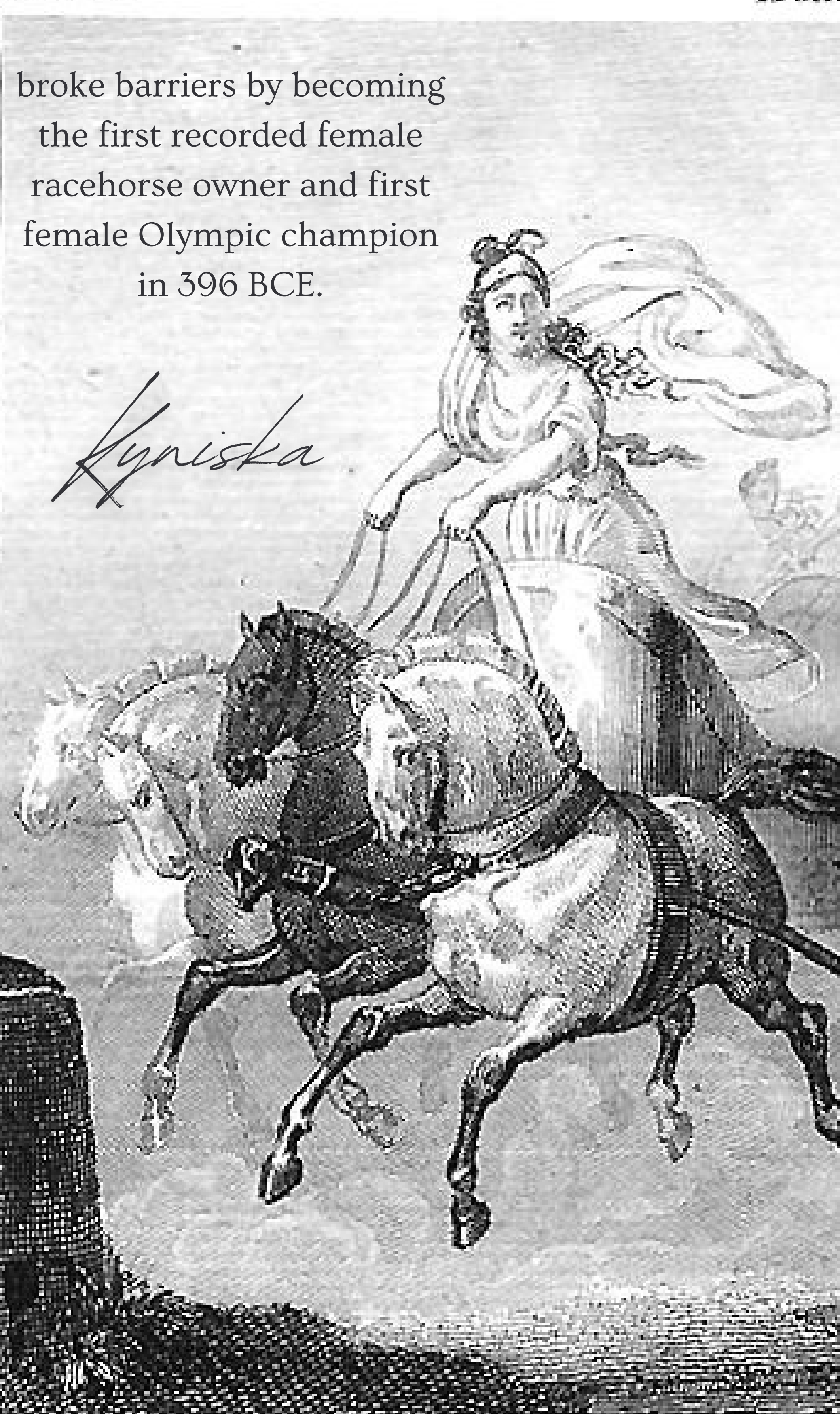
Cynisea remporte le prix à la Course des Chars.